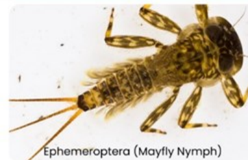
Ephemeroptera (Mayfly Nymph)

Pollution sensitive – most likely to be found in good quality water