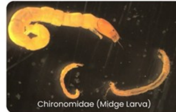
Chironomidae (Midge Larva)

Highly pollution tolerant – most likely to be found in poor, fair, and good quality water