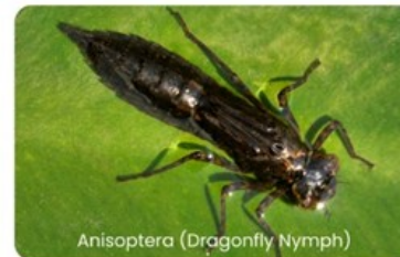
Anisoptera (Dragonfly Nymph)

Semi-pollution tolerant – most likely to be found in fair and good quality water