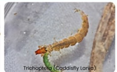
Trichoptera (Caddisfly Larva)

In 2024, Georgian Bay Biosphere staff found a variety of organisms in Kapikog Lake including both pollution tolerant and pollution sensitive organisms. The fact that pollution sensitive organisms were found in good numbers means that the lake is healthy. If water quality was impaired, the pollution sensitive organisms would not be able to survive, and they would not have been collected during 2024 sampling. The presence of pollution tolerant organisms is not cause for concern; these critters also exist in healthy lakes.