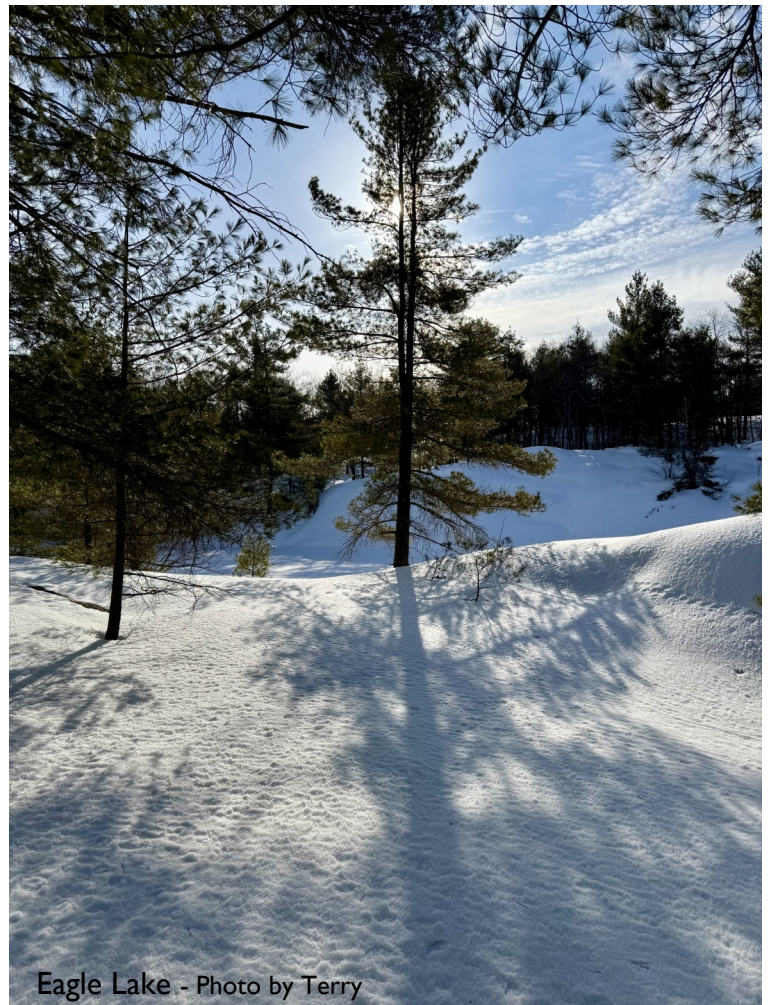
Eagle Lake