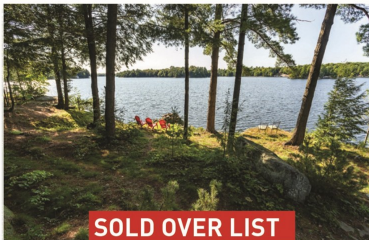
SOLD OVER LIST Kapikog South Rd $899,000*