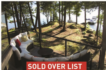
SOLD OVER LIST Wawashkosh Island $699,000*