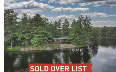
SOLD OVER LIST Joyce Lane $999,999**