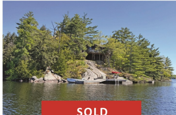
SOLD Wawashkosh Island $1,069,900*