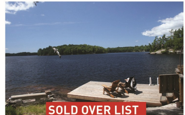
SOLD OVER LIST Kapikog South Road $499,950*

*Represented Seller, **Represented Buyer