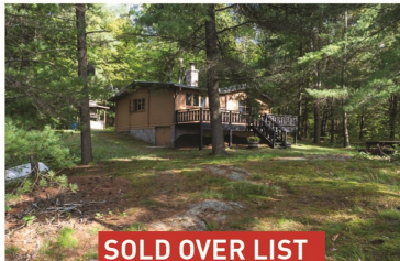
SOLD OVER LIST Kapikog South Road $569,000*