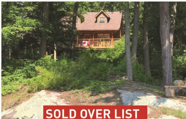
SOLD OVER LIST Wawashkosh Island $659,000*