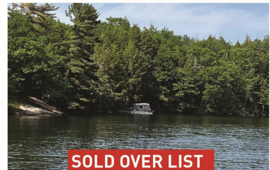
SOLD OVER LIST Wawashkosh Island $689,000**