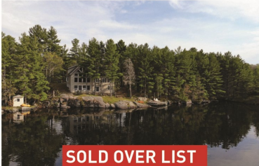
SOLD OVER LIST Grant's Trail $1,195,000*