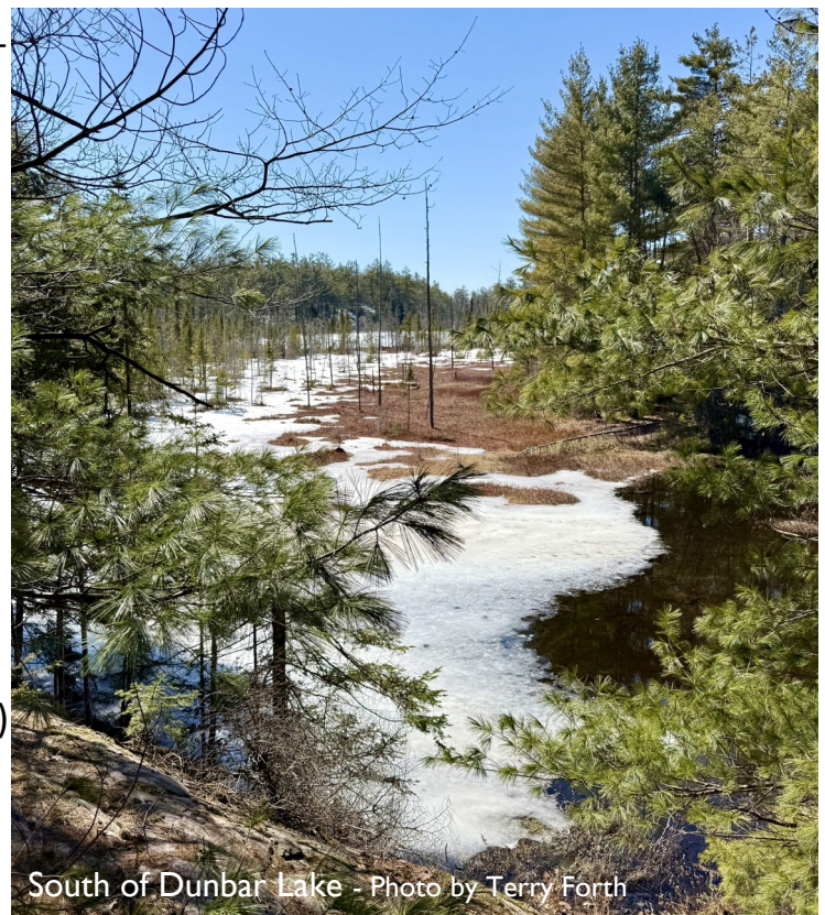
South of Dunbar Lake